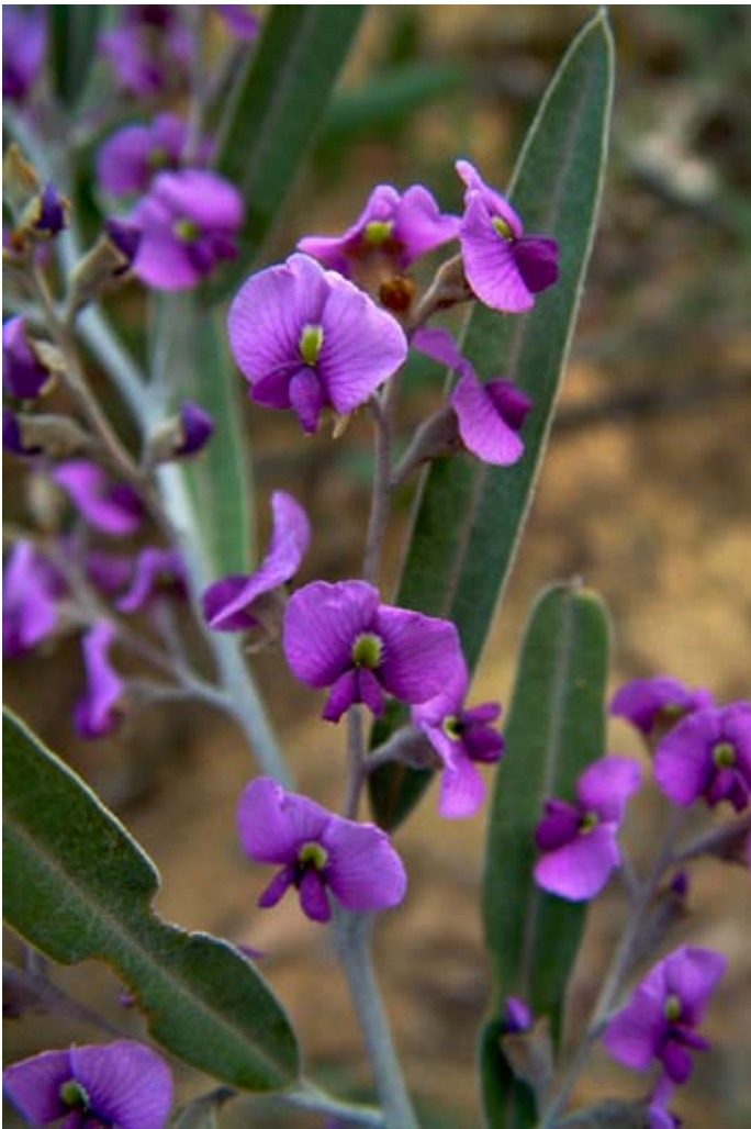
Above: Hardenbergia violacea