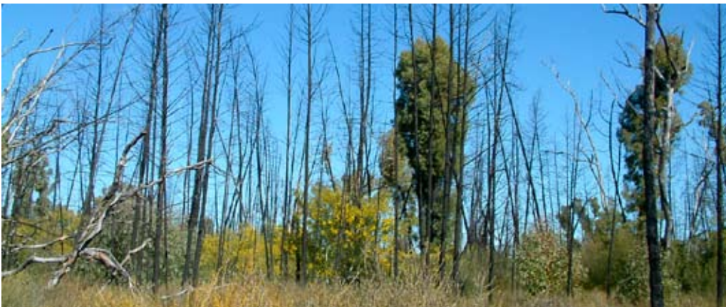
Above: Pilliga (p6-8)