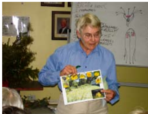
Penelope at the Birds in backyards Forum

how a garden can attract birds, provides design tips, and lists suitable plant species.